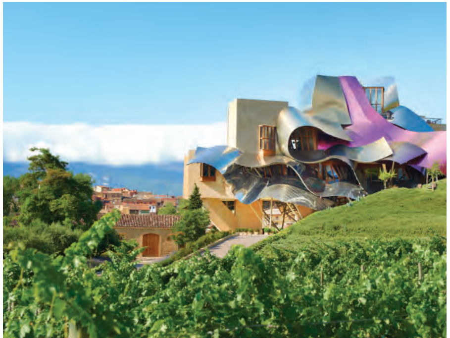
Hotel Marques de Riscal