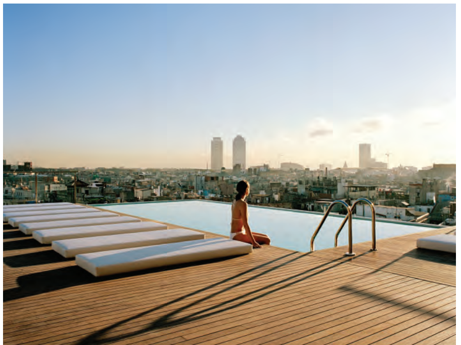
Grand Hotel Central

It is possible to add extra nights in Paris, Barcelona, La Rioja and Bilbao. Speak to one of our Personal Travel Specialists for ideas on other additional locations.