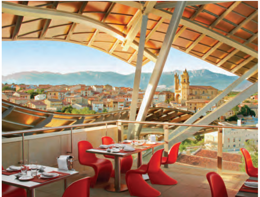
Marques de Riscal

Designed by Frank O. Gehry (as is Bilbao's Guggenheim museum) – the hotel has a strikingly modern design and forms part of the Marques de Riscal City of Wine. Marques de Riscal was the first wine cellar of the area – built in 1858. The hotel is clad in sandstone with great sweeping panels of titanium and stainless steel. Somehow this does not look out of place in the traditional, medieval town of El Ciego. The hotel provides the perfect base to explore the tradition, gastronomy and landscape associated with wine. There is a wine spa offering beauty and anti-stress treatment based on grapes and wine.