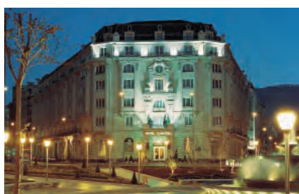
Hotel Carlton Bilbao